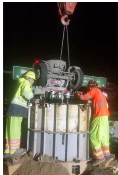
Reinforcement of toll sign foundations