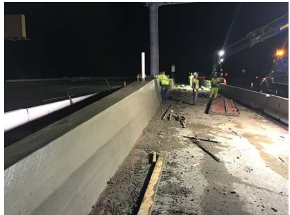
First image: Construction crews prepare a sign foundation area for a concrete pour. Second image: Crews complete a concrete pour in a separate location.