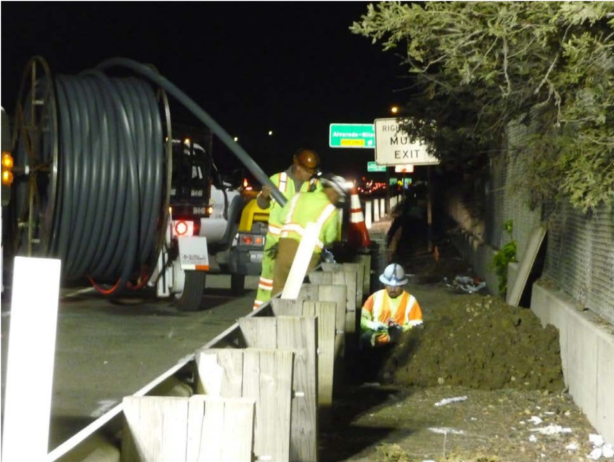
Crews bore conduit in the shoulder near Alvarado Niles Road.

Civil construction of the I-880 express lanes is about 20% complete. Crews have installed the majority of the Cast in Drilled Hole pile foundations that will support express lane light stands and overhead gantries. These overhead gantries will support express lane signs and tolling equipment. The first of the overhead sign structures and static signs have been installed. Workers also completed tree removal near Hacienda Avenue to prepare for a short stretch of highway widening. Finally, crews have installed about 10% of the electrical and data network that will power the tolling equipment and facilitate the transfer of tolling data.