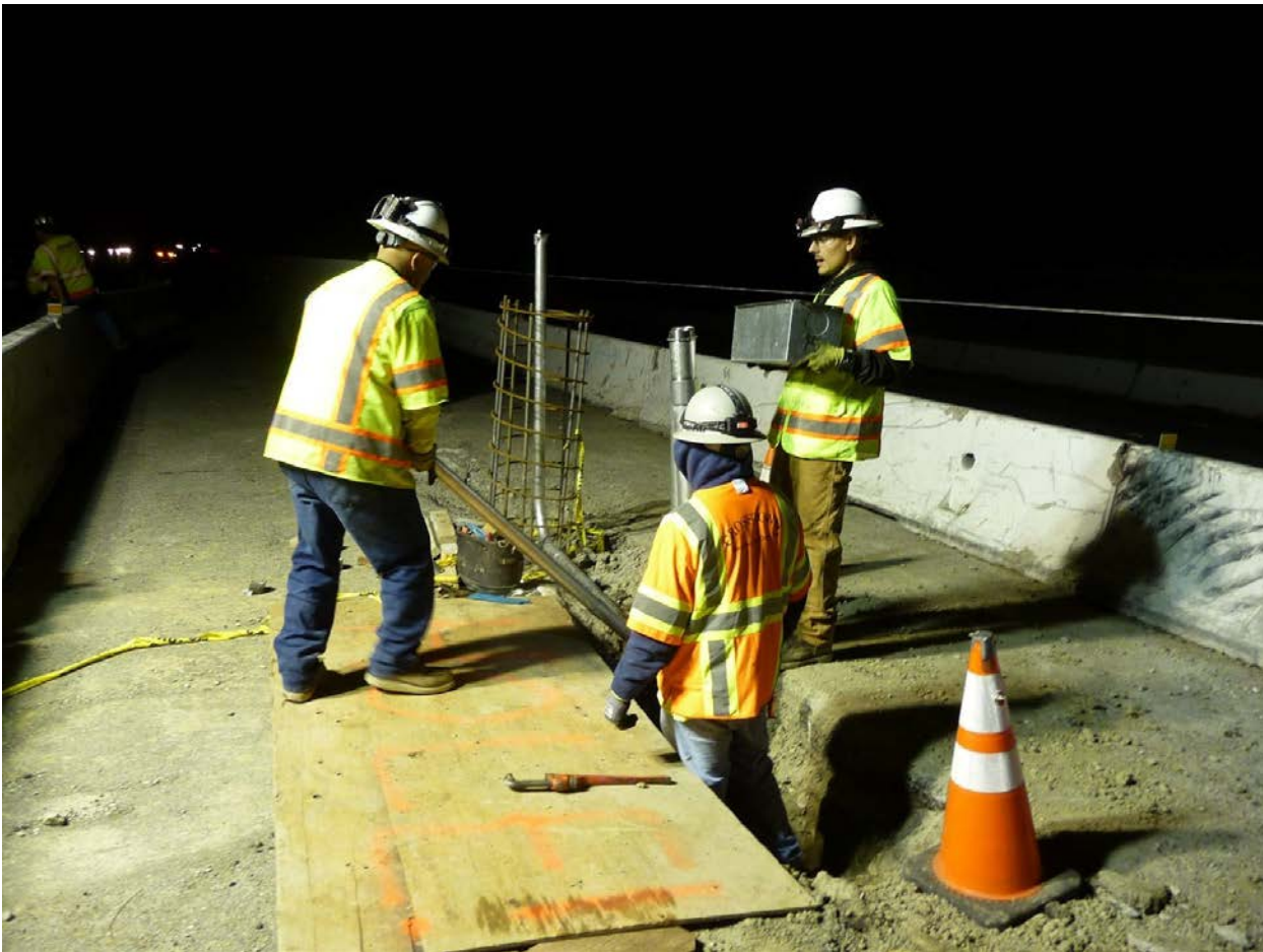
Crews terminate conduit at a light standard between Alvarado Niles Road and Whipple Road.

If you would like to add people to our email list, or if you experience significant impacts or have questions, please contact us.