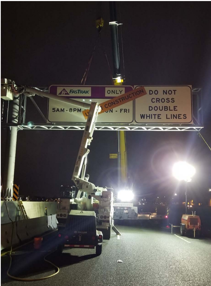
Crews install overhead signs on sign gantry.