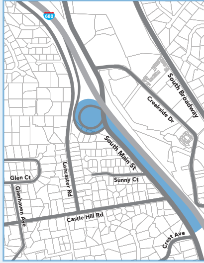
WALNUT CREEK (S. MAIN STREET) AREA

TREE REMOVAL AREAS WITHIN FREEWAY WIDENING LOCATIONS