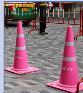
Colorful Traffic Cones