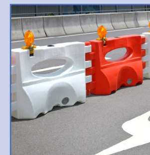
Plastic K-Rails/Jersey Barriers