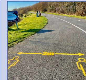
Social Distance Line Segments