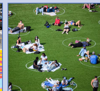
Social Distance Spherical Planes