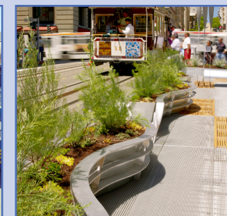
Seating and Landscape Edges