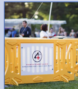
Colorful Crowd Barrier