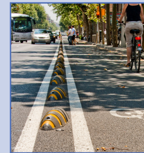
Armadillo Lane Separator