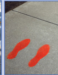
Social Distance Painted Points