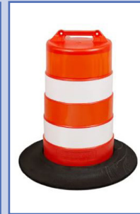
Plastic Drum Bollards