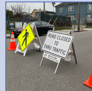
A-Frame Signage Barrier