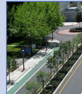
Complete Streets Spatial Configuration