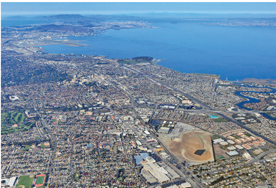
Aerial view of Station Area, looking north to the bay.

The Station Area is bounded on the west by residential neighborhoods, on the north by residential neighborhoods and retail areas along El Camino Real, on the east by the Bay Meadows Phase II project area, and to the south by retail areas and the Hillsdale Gardens development.