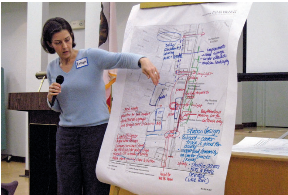
Community Workshop 1.

The City held its first community workshop in March 2010, to establish broad area-wide goals and develop a vision for the Station Area. Citizens, City staff, and stakeholders explored the benefits of TOD and participated in small groups that mapped out strengths in the Station Area, and identified which areas could use change. For this workshop, and those that followed, the City conducted extensive outreach: newspaper and website notices, mailing to all property owners and residential and commercial tenants inside and within 500 feet of the Station Area, posters at the Hillsdale station, in-person flyers at the station, emails to interested organizations throughout the City, as well as those focused on affordable housing, and a letter to participants in the stakeholder interviews inviting them to attend upcoming workshops.