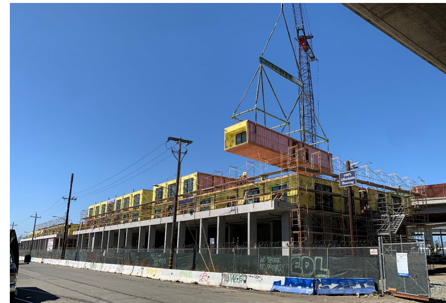
Image: Modular housing project in San Leandro